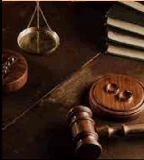
Specialized Legal Consultations