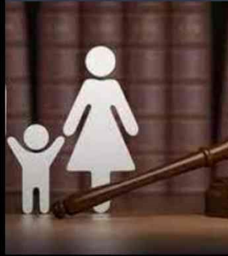
Personal Status Law