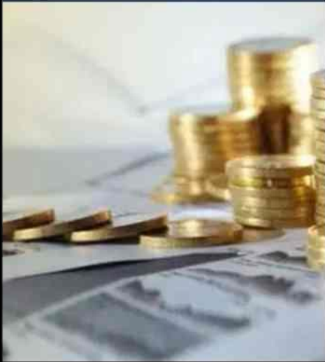
Commercial and Corporate Law